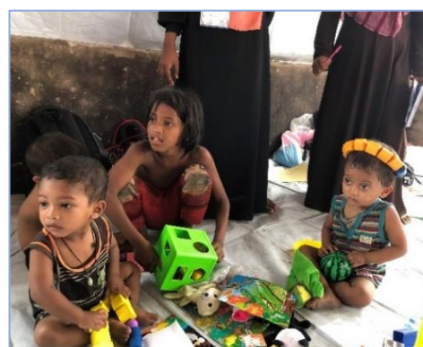
Children playing at the INF

Nutrition teams from UNICEF and WFP jointly visited the affected areas to assess the needs and guide the response. Based on the findings of the assessment, access to water is one of the most urgent needs, and steps have been initiated to provide water at the two INFs.