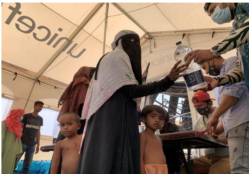
Families gather in an emergency UNICEF nutrition point set up in the aftermath of a massive fire