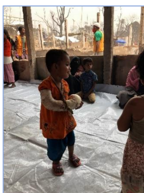
Girl with fractured arm playing at the INF