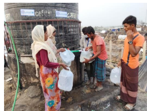
People collect safe water from a UNICEF temporary water distribution point in Camp 8W

In Camp 8E and 8W, six water supply networks and 190 tube wells have been damaged. Two of the water supply networks have been repaired with the damaged solar panels replaced and portable generators set up to pump up and provide safe water at distribution points. So far, 76 of the damaged tube wells have been repaired. In total, safe water is being provided to an estimated 12,500 people.