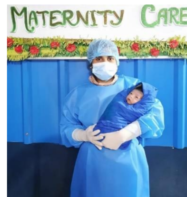
The midwife with a Rohingya new-born boy

UNICEF, through its partners, deployed a mobile medical team (MMT) in the affected areas. On Wednesday 24 March, the MMT provided services to 265 patients (38 females, 159 males and 68 children) including one child with disability. The majority of patients were suffering burn and cut injuries and other health problems as well including cold, fever and diarrhoea.