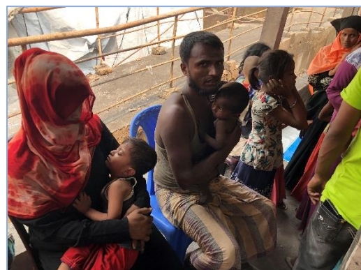
Father queuing for his child to be screened

Two INFs in Camp 9 and Camp 8E were destroyed by the fire. Despite this, both INFs have been made functional by UNICEF and its partners and started providing emergency nutrition services including the screening and management of acute malnutrition within 24 hours of the fire. On 24 March 2021, 302 children (175 girls and 127 boys) were screened for acute malnutrition and 23 children (18 girls and 5 boys) were identified as severe acute malnourished and provided with Ready-to-Use Therapeutic Food (RUTF). UNICEF and partners temporarily mobilised INF staff from neighbouring camps to provide support. Two breastfeeding corners have been established in the two INFs that supported over 50 mothers to breastfeed their babies. Mothers expressed satisfaction to have a private, and safe place for breastfeeding. Play areas were also established in both INFs to alleviate child sufferings and over 33 children benefitted from playing there.