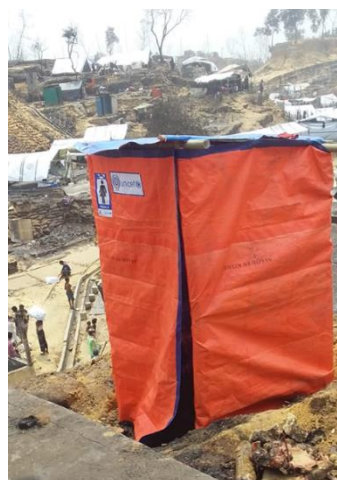
An emergency latrine in Camp 8E

With 750 latrines having been destroyed in Camp 8E and 8W, a total of 82 emergency latrines have been constructed which can provide access to 4,100 people in line with the SPHERE standard of 50 people per latrine during acute emergency. UNICEF is also prioritizing areas where people have returned and are rebuilding their homes as locations for the construction of emergency latrines.