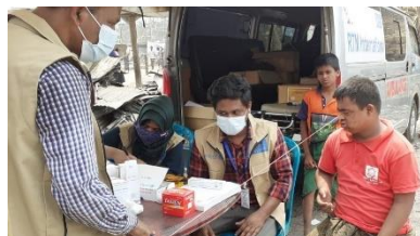
MMT at the affected areas at Camp 9

Despite the damage and limited staff, the UNICEF-supported PHC in Camp 8W has been open and continuing to provide emergency health care services. As the delivery room was severely damaged, health workers used another room in the facility where a 20-year-old Rohingya mother delivered a baby boy in the evening of Wednesday 24 March. This example shows the critical importance of this centre to the affected population. Within 48 hours after the fire, UNICEF delivered medicines and oral rehydration salts, basic medical equipment and other critical items including one generator, four water filters and 34 tarpaulins to the PHC in this camp to support the families who lost their homes including those of the Rohingya community health volunteers, porters and cleaners.