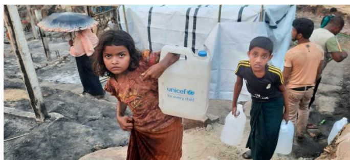
Children collect water from a UNICEF temporary distribution point in Camp 8W

Kits and soap to affected families. UNICEF is reinforcing hygiene promotion activities by engaging Community-Based Volunteers (CBV), WASH committee, water and latrine users' group. Out of 123 CBVs in two affected camps, 56 are highly affected (21 female and 35 male). Currently all CBVs are actively engaged in hygiene promotion activities through households visit, promoting hygiene practices including handwashing, safe handling of drinking water, use of Aquatabs, and safe management of menstruation.